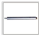
extension rod (included)